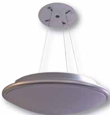
Drop Wire Pendant

Anti-tamper screws and IP44 versions are available across the range. These units cannot be semi-recessed.