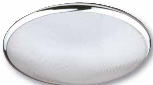
Chrome / Prismatic