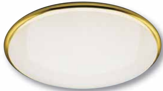
Brass / Opal