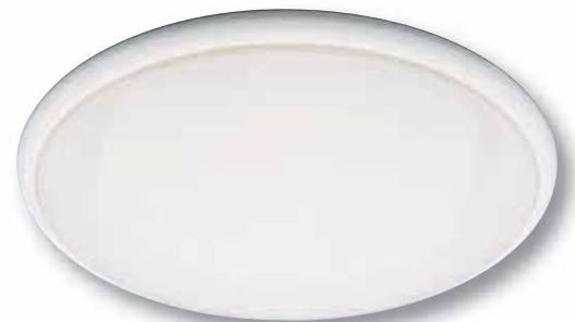
White / Opal