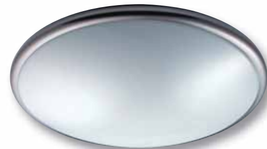
Graphite / Opal (non standard colour option)