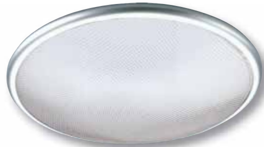
Satin Aluminium / Prismatic